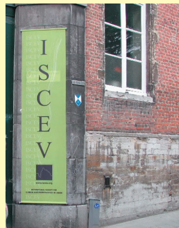
The man himself fixed the poster – before (left) and after (right)