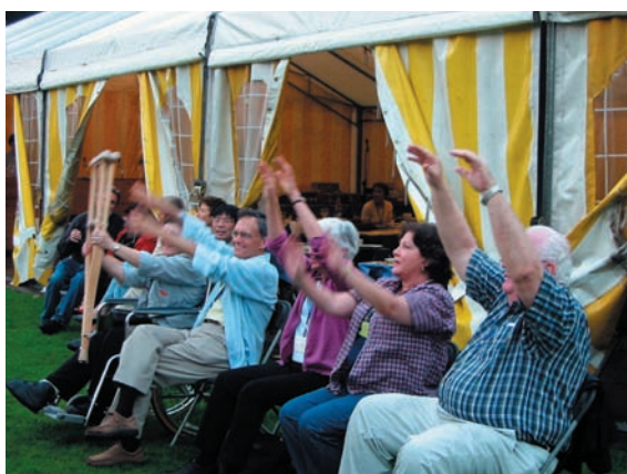
Handwaving from the American Team