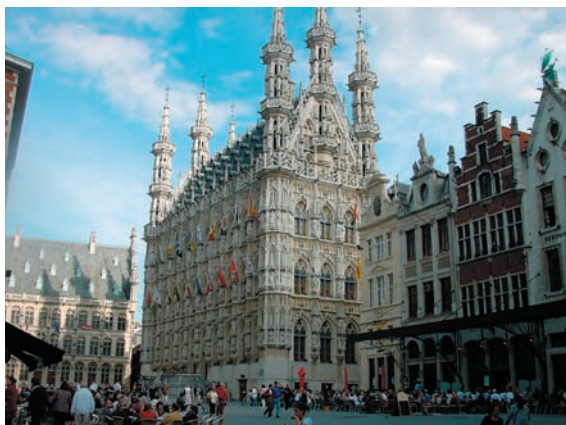
Beautiful Leuven town centre