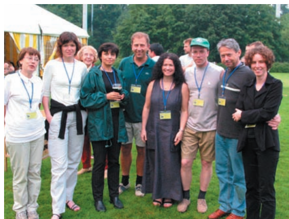
The European Team