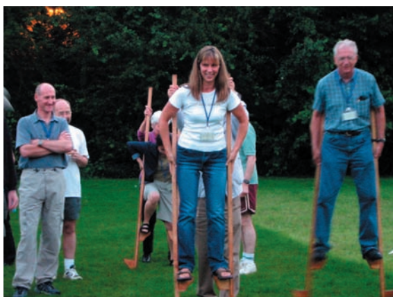
Stilting, one of the new ISCEV Olympics disciplines