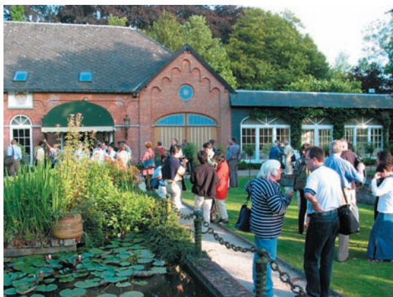
The beautiful site of the farewell banquet