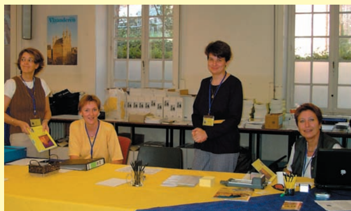
The symposium team before the symposium