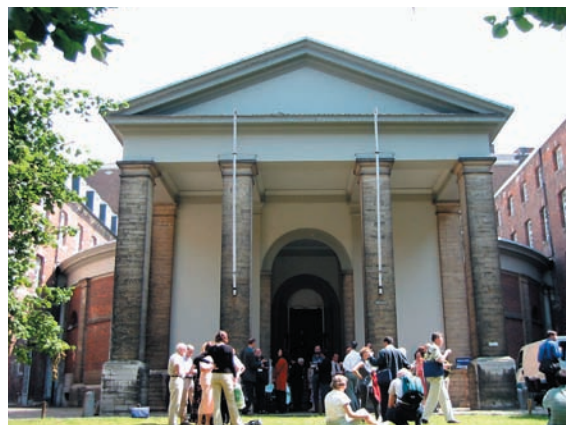
The Symposium Site