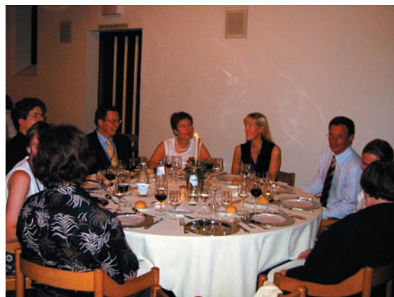
The symposium team at the last evening